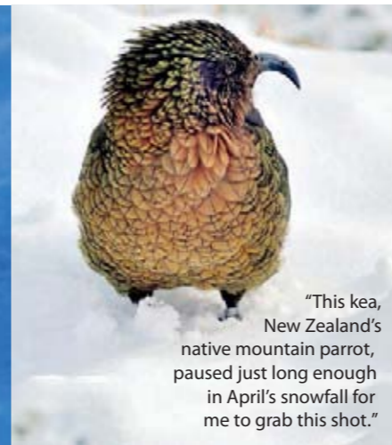
"This kea, New Zealand's native mountain parrot, paused just long enough in April's snowfall for me to grab this shot."