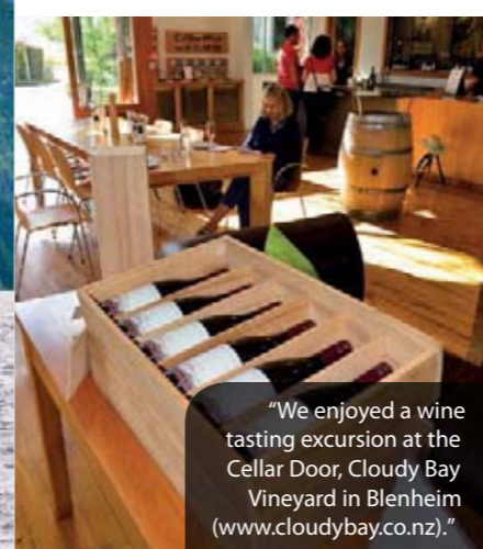
"We enjoyed a wine tasting excursion at the Cellar Door, Cloudy Bay Vineyard in Blenheim (www.cloudybay.co.nz)."