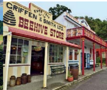
"We indulged in delicious crayfish (below) cooked at one of many roadside barbecues in Kaikoura and ate it alfresco beside the sea. On the left is Shantytown, near Greymouth, which is a heritage recreation of the old gold-rush days in New Zealand. You should allow at least half a day to visit it."