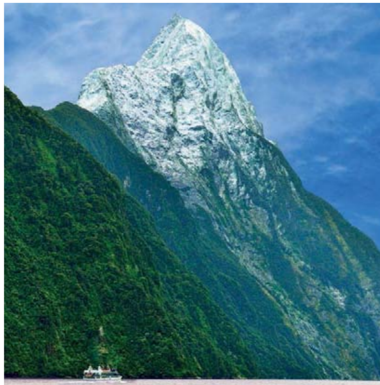
"Doubtful Sound was an overnight cruise (www.realjourneys.co.nz) with majestic peaks that tower hundreds of metres both above and below sea level, cascading waterfalls and pristine rainforest. It's undoubtedly the most spectacular of New Zealand's 15 fiord's. We saw Milford Sound (pictured) too (www.southerndiscoveries.co.nz) where we recommend visiting the Milford Discovery Centre and Underwater Observatory."