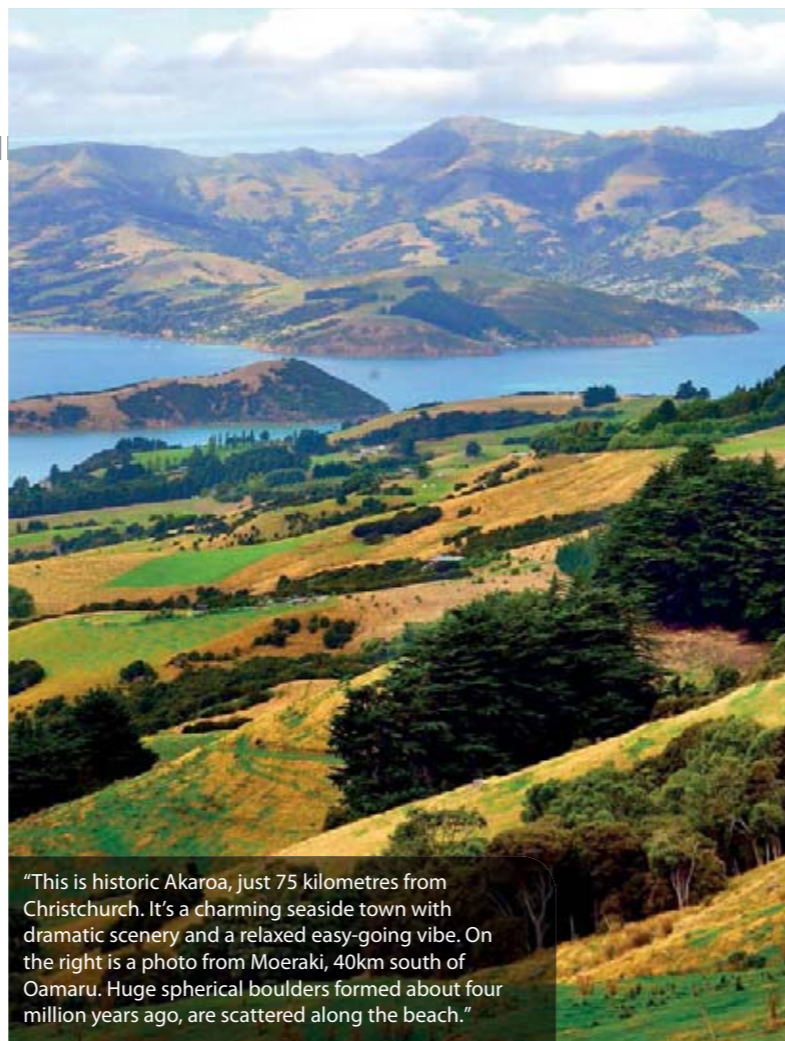
"This is historic Akaroa, just 75 kilometres from Christchurch. It's a charming seaside town with dramatic scenery and a relaxed easy-going vibe. On the right is a photo from Moeraki, 40km south of Oamaru. Huge spherical boulders formed about four million years ago, are scattered along the beach."