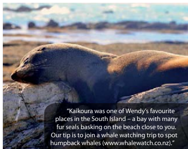
"Kaikoura was one of Wendy's favourite places in the South Island – a bay with many fur seals basking on the beach close to you. Our tip is to join a whale watching trip to spot humpback whales (www.whalewatch.co.nz)."