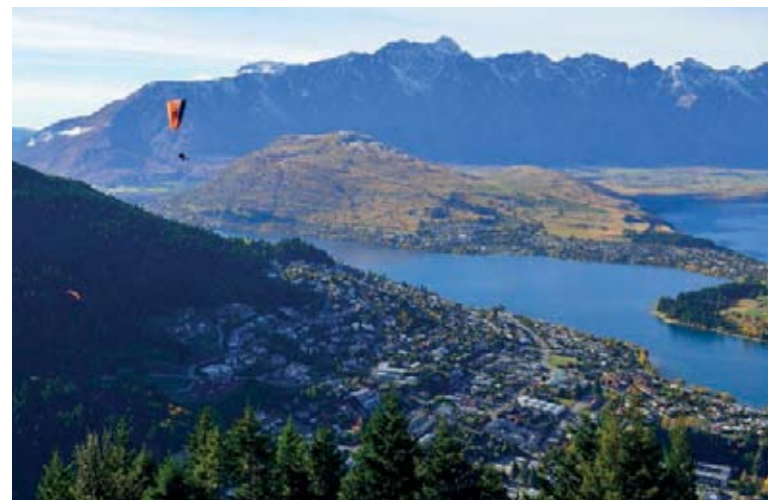
"Above is Queenstown and Lake Wakatipu seen from the town's Skyline Gondola with the Remarkables range behind. The surrounding Central Otago region is known for its Pinot Noir and Chardonnay vineyards, and for adventure sports. We enjoyed the Shotover river trip (www.shotoverjet.com) and escaped the crowds on Queenstown's small boat lake cruise for the Mount Nicholas High Country Farm experience (www.southerndiscoveries.co.nz)."