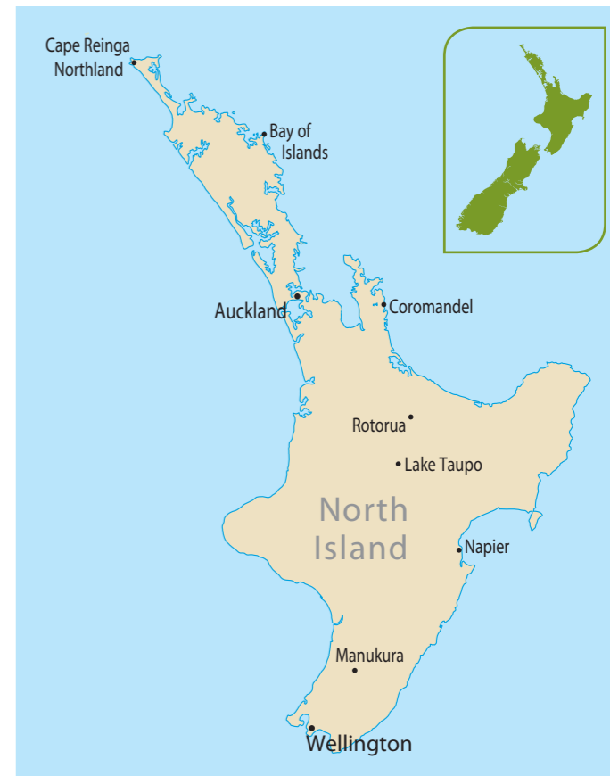
You can read more about Gary and Wendy's trip in Practical Motorhome magazine's February and March 2016 issues.

"We made sure to stop off at Coromandel Peninsula's Hot Water Beach where you can dig in the soft sand around low tide to bathe in its warm thermal water, free of charge."